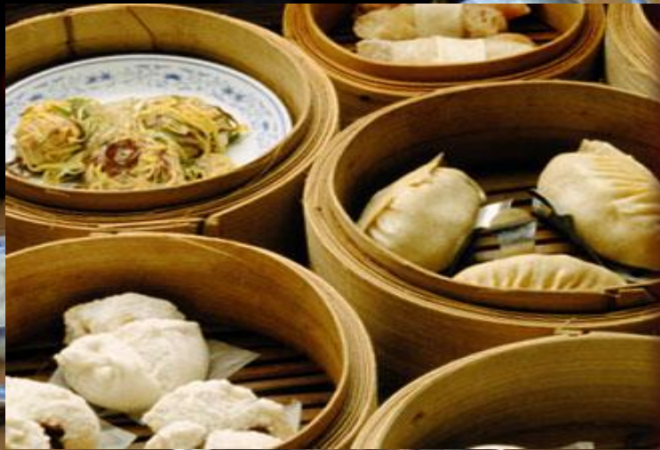
mantou (steamed bread)